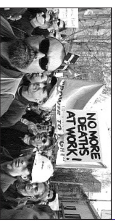
Safety remains a major issue in today's construction industry.