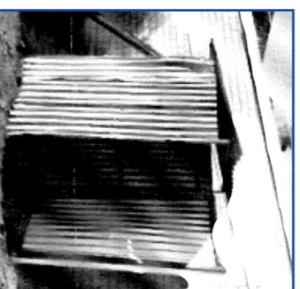
Bosses were still trying to get away with dunnies like this on building sites in the 1980s.

1902: FIRST BUILDING INDUSTRY SAFETY LEGISLATION in NSW. The Scaffolding & Lifts Act , and government safety inspectors introduced after years of union campaigning