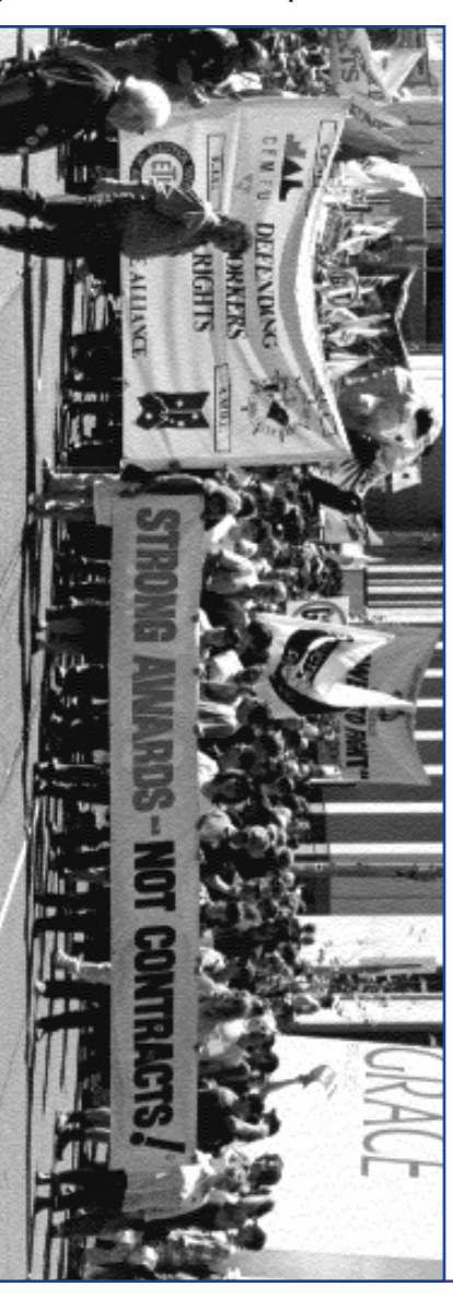
Defending 100 years of achievement against current Federal Government attacks. Victorian building workers demonstrate September 1998.

1997: PORTABLE SICK LEAVE achieved in Victoria. Untaken sick leave is credited to the Portable Scheme on termination and may be used by the worker in his/her next job.