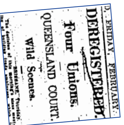
The Sydney Morning Herald headline (Feb 4, 1927) when Queensland workers refused to vote on returning to work in support of strike action for a 40-hour week. The 'wild scenes' in court amounted to singing the 'Prisoners Song' and 'Red Flag' and cheering during breaks in the proceedings, according to the report.