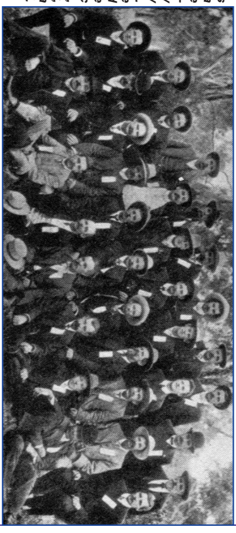
Picnic days have been a feature of the union movement but only a paid day since 1969. Pictured: the Federated Building Trade Picnic Committee, National Park, South Australia Nov 30, 1907.

1981: 38 HOUR WEEK (beginning of Rostered Days Off — RDOs)