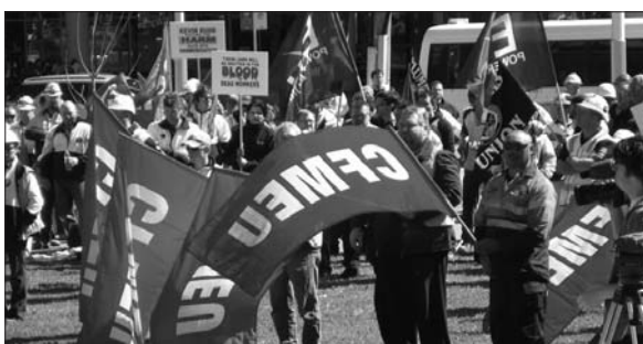
Pictured above right: Rallying for safety and the abolition of the ABCC in Brisbane on Sept 1.

Make sure you support the campaign. We owe it to our kids to make our industry as safe as possible.