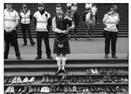
Right: Remembering workers who have lost their lives on the steps of state Parliament, Melbourne.