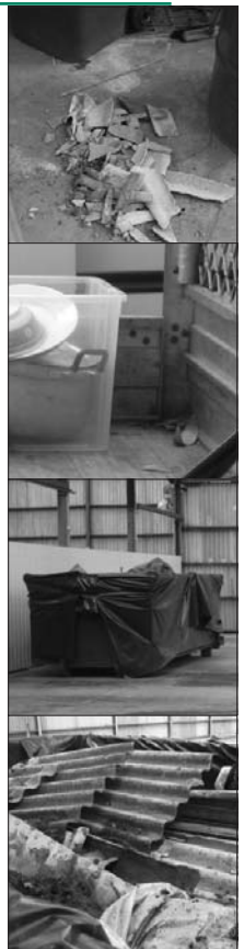
Top 1. Asbestos heap not far from drain.

That’s not necessarily a problem except the operator was riding the hoist, which is not allowed,