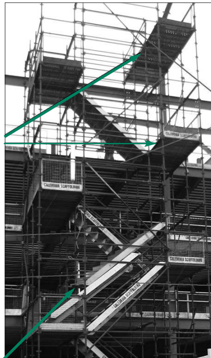
The top flight of stairs appear to have blown from scaffold frame at top level and taken a lower flight down with it, as indicated above, on Adelaide Lyell McEwin Hospital site.

‘A gust of wind seems to have picked up the top flight of stairs – like a sail – and sent it crashing on