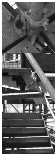
Above: the temporary rectification with doubles and clips; open rises allow the wind to blow through; enclosed stairs which caused problems in strong winds.