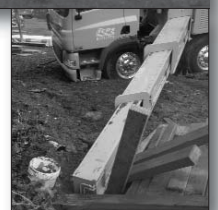
Old Pentridge Prison site where a worker was killed during a concrete pour when the pump failed as above.